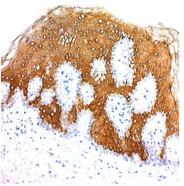
Human Skin Stained with Cytokeratin 10; Clone DE-K10 using UltraTek HRP and DAB Chromogen. 200X Magnification