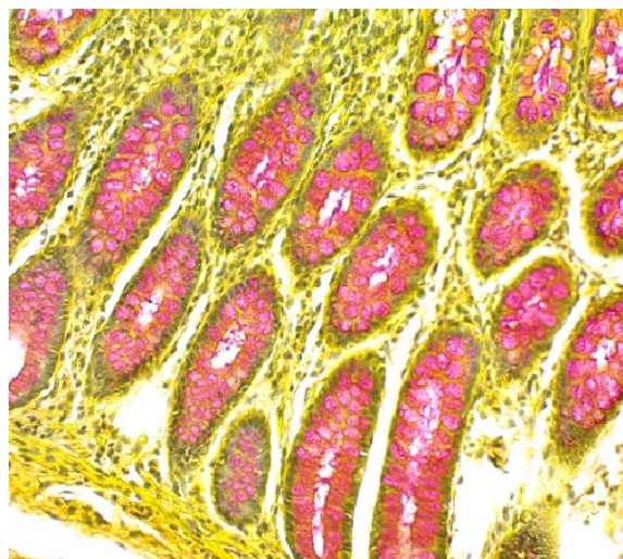
Epithelial mucins in Human GI tract demonstrated with Mucicarmine Stain Kit